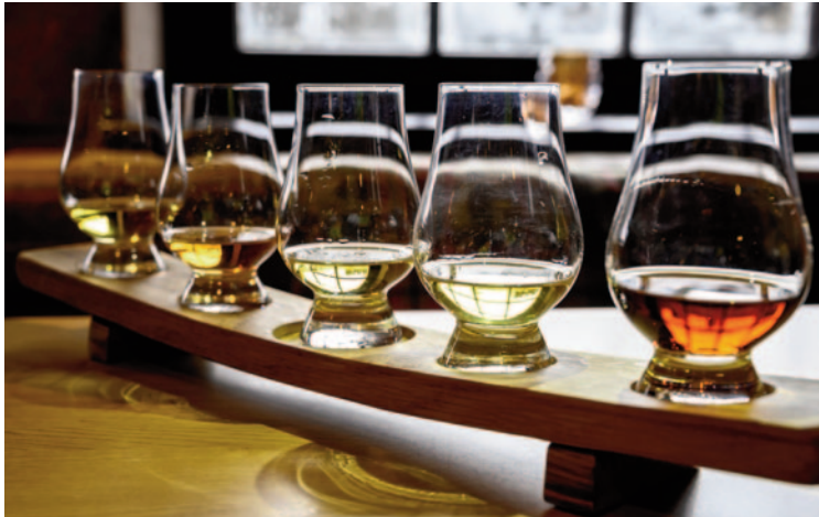
SAMHAIN GATHERING/WHISKY TASTING SATURDAY, OCTOBER 22

Robert Burns Celebration & Dinner March 4, 2023