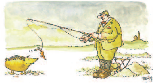
CATCHING HAGGIS IN SCOTLAND