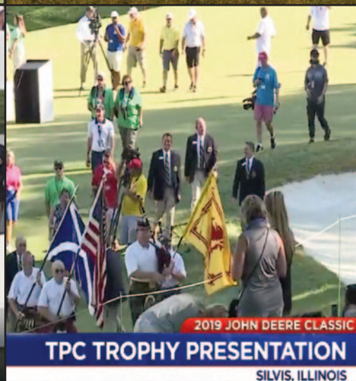
2019 JOHN DEERE CLASSIC TPC TROPHY PRESENTATION SILVIS, ILLINOIS